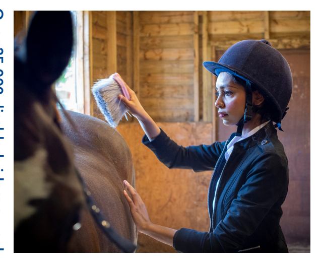
65+ represents the fastest growing participant age group