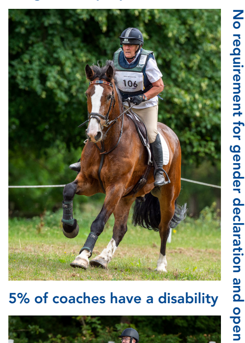
5% of coaches have a disability